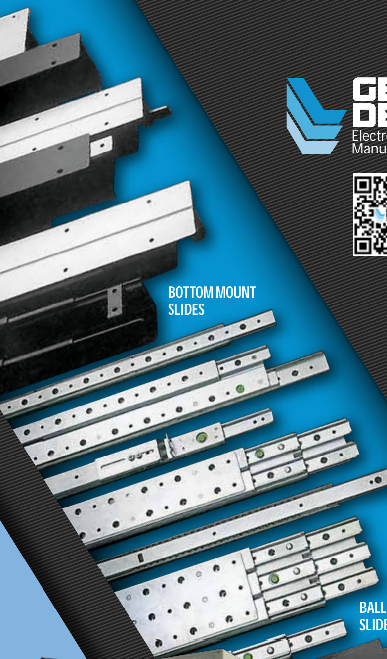
BOTTOM MOUNT SLIDES